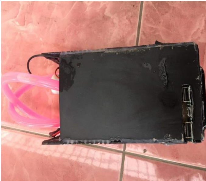
Fig. 5. The perspective view of the device shows the USB ports for charging.

Table I shows the voltage output based on the substance used on the cold side and the waste heat source used on the hot side. The cold substances used were tap water, cold water, and coolant while the waste heat sources were flat iron, BBQ grill, aircon, and motorcycle exhaust. The duration of the testing was for 15 minutes only. The percent charge of the battery was computed to show the increase in voltage. The initial battery voltage was the voltage before testing while the final battery voltage was the voltage after testing the device. The temperature change was calculated to determine how well the waste heat source and substance work in the device. The percent charged was also computed to determine how much charge had changed in the battery during the 15 minutes of testing.