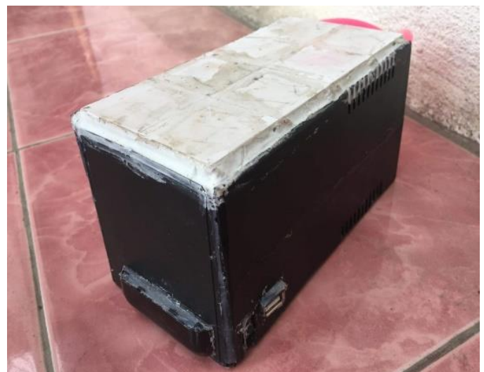
Fig. 3. The perspective view of the device shows the bottom where the TEGs are attached.

The working prototype of the device is shown in Fig. 3, Fig. 4, and Fig 5. The thermoelectric generator modules are directly mounted to the radiator to balance the temperature difference. On the other side of the radiator, the water tank and the motor pump which provide circulation of the water and batteries are mounted. The connected power bank circuitry is placed at the back of the device to show the charging capacity of the battery. The equipped USB ports are found above the device. Alongside the power bank circuitry is the step-down USB port. The casing of the device is a plastic power supply box. The switch is found on the left side of the device which is used to cut on or off the flow of electricity drawn to the water pump. The device is lightweight and can be carried anywhere and at any given time.