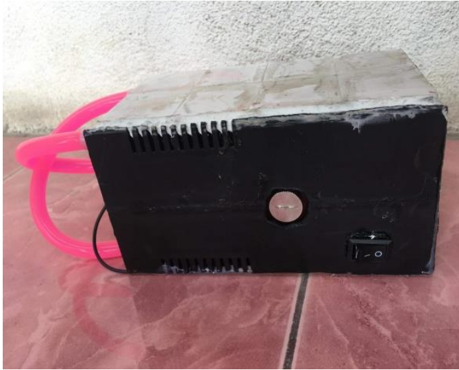
Fig. 4. The perspective view of the device shows the side view where the switch is located.